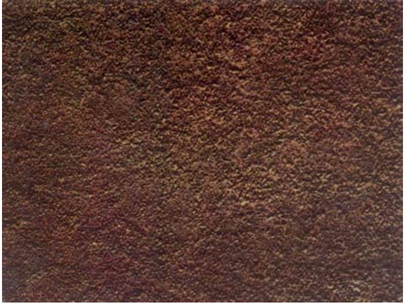
Rust Grade D