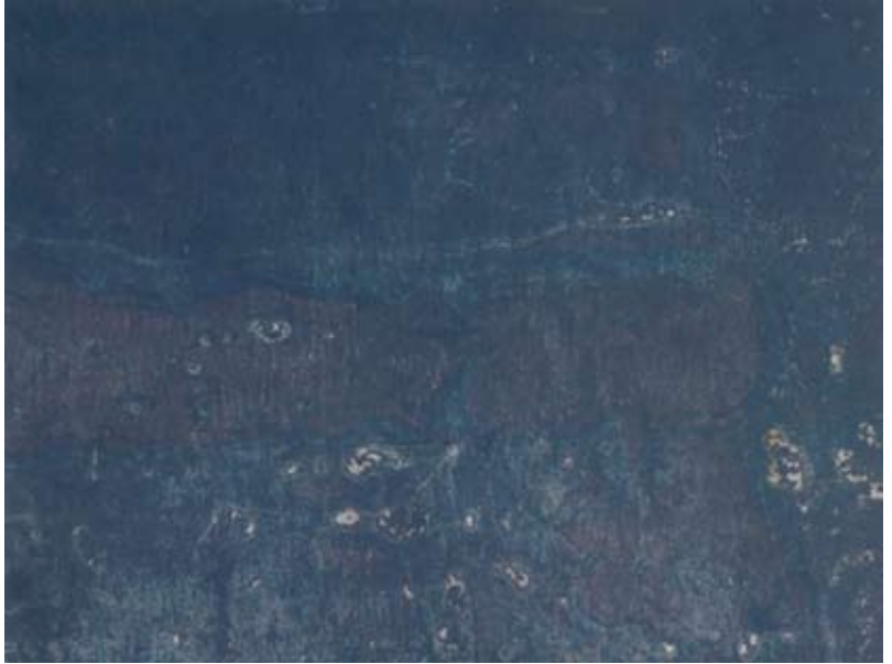
Rust Grade B