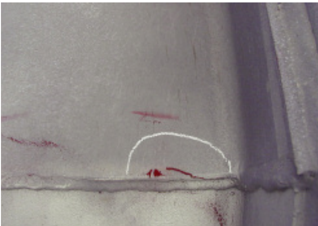
Fig. 1 — Three examples of cracks that weren't visible originally, but which showed up through use of magnetic particle testing.

field measurement (ACFM) shows significant promise for this application; however, the most economical and commonly used nondestructive examination method is magnetic particle inspection (AC yoke with dry powder).