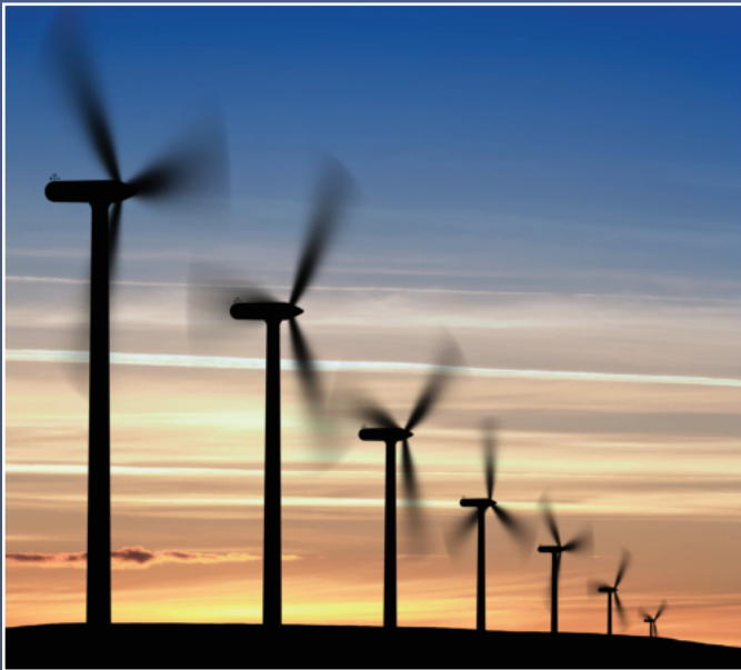
Xylan keeps wind farms running smoothly...