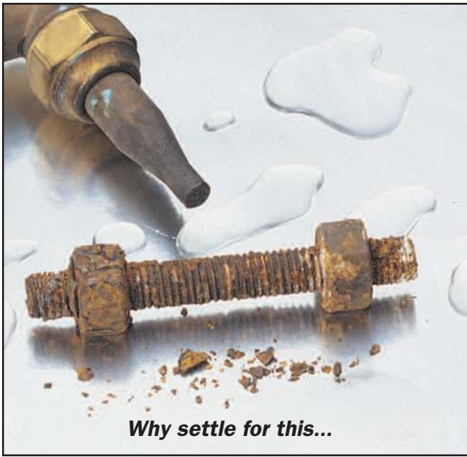
Why settle for this...