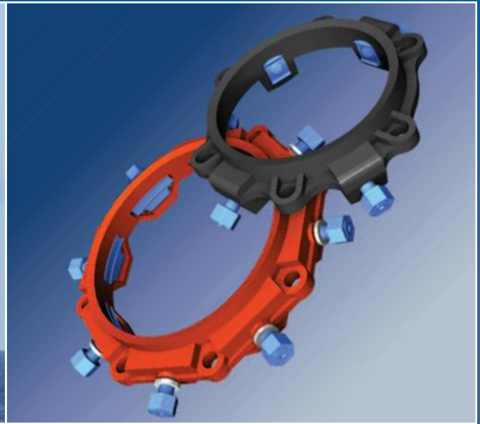
Provides controlled friction and corrosion resistance...