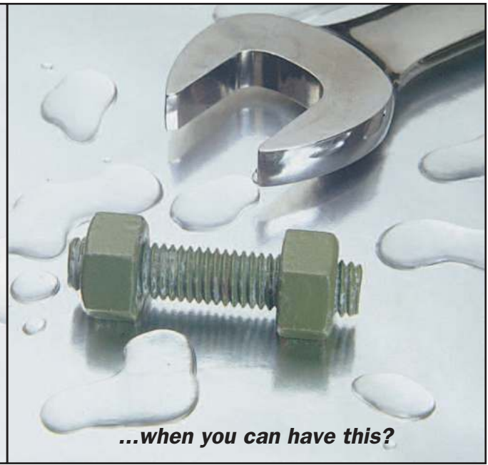
...when you can have this?