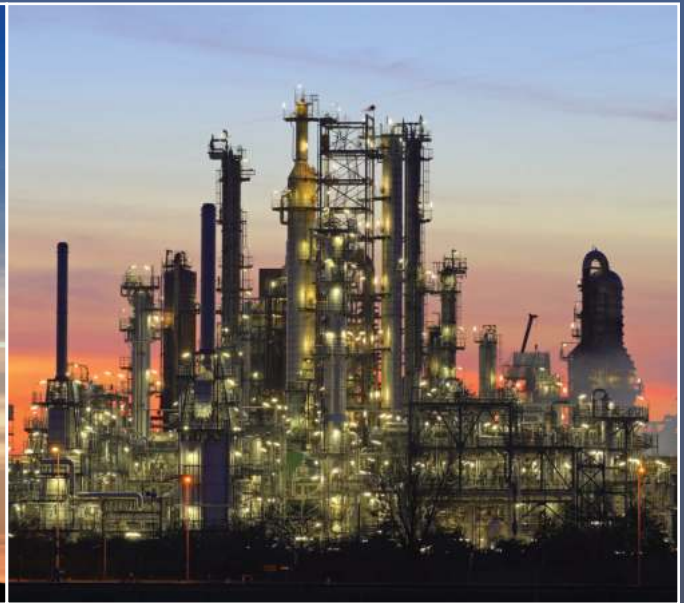
Solves many problems at chemical processing plants...