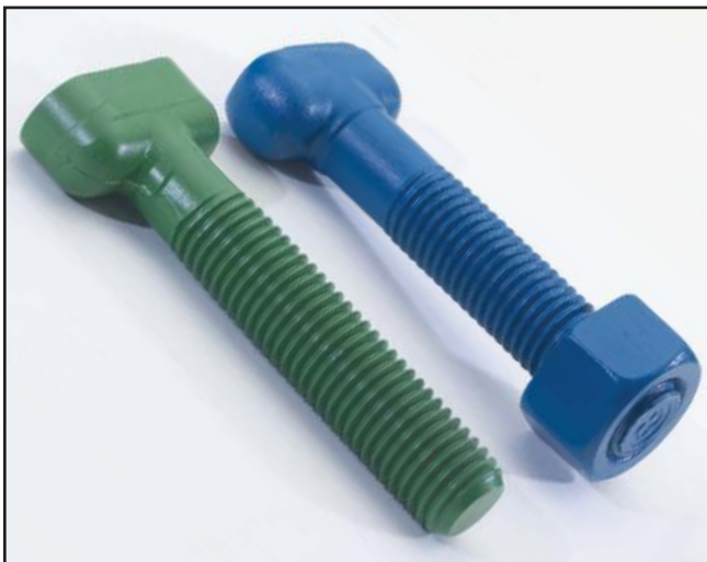
Xylan offers fasteners such as T-Bolts controlled torque, corrosion resistance and color-coding.

Xylan coatings solve as many problems for the oil industry as they do for waterworks.