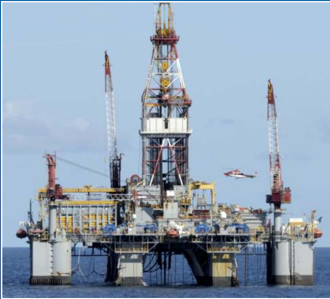
Xylan offers multiple benefits for oil rigs...